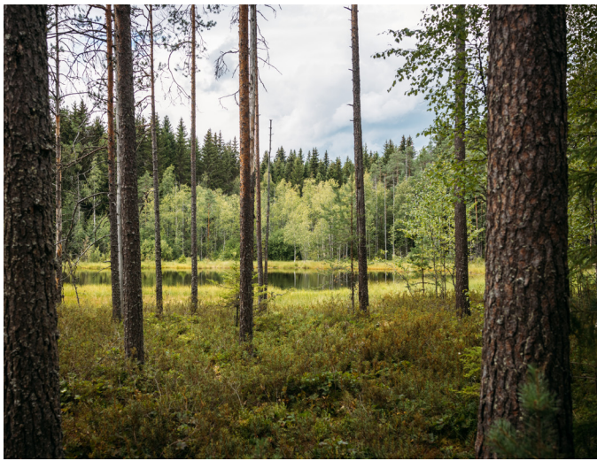
The Kintterönlampi pond, boggy around the edges, was formed in a kettle hole.